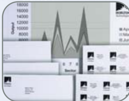
Superb quality printing on a wide range of paper types, transparencies and envelopes