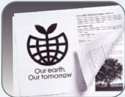
Paper saving double-sided printing